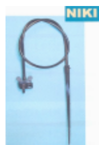
One Pot Sprayer