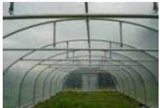
50.8mm diameter high tensile steel with 1.5mm wall thickness