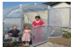
Double Half Doors