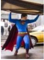
2mm thick steel adds 33% to frame strength