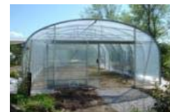
Heavy Duty Steel Sliding Door