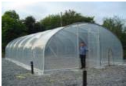
800 Gauge Polythene with anti-fog layer and 5 year UV guarantee