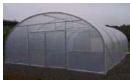
Steel Double Hinged Door