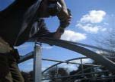
Facilitates fitting of a separate cover for the gable end, which removes pleats and folds