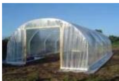
Timber Gable, No Door