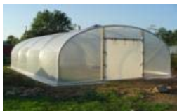
Timber Gable & PVC Flap