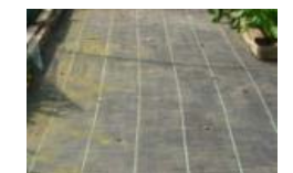
Woven polypropylene fabric that suppresses weeds