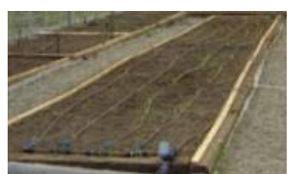
Tubing which leaks out water in a controlled way along its length