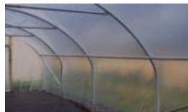
Bars along the sides to significantly increase strength in windy areas