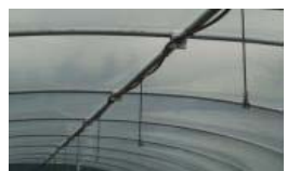
Sprays water over whole floor area. Auto timers available.