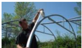
Protects polythene from heat and chaffing in windy areas