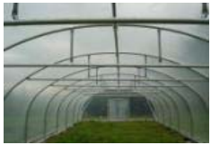
50.8mm diameter high tensile steel with 1.5mm wall thickness