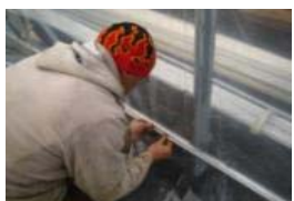
Alternative to burying polythene