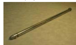
Alternative to using concrete to anchor the steel frame